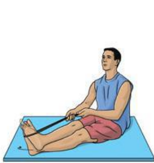
Resisted ankle inversion