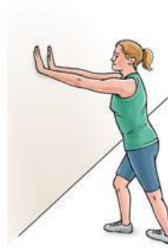
Standing calf stretch