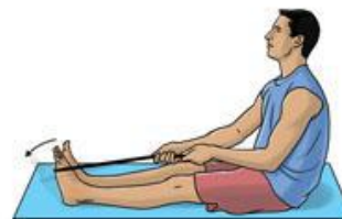
Resisted ankle plantar flexion