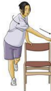
Balance and reach exercise B