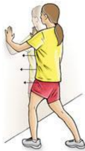
Standing soleus stretch