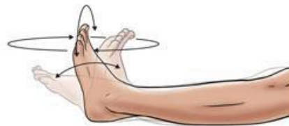
Ankle active range of motion