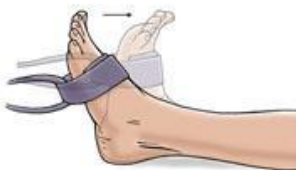
Resisted ankle dorsiflexion