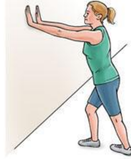
Standing calf stretch