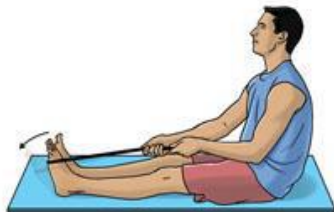
Resisted ankle plantar flexion