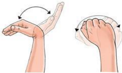
Wrist range of motion