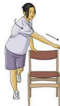
Balance and reach exercise B