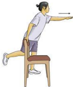
Balance and reach exercise A