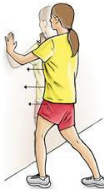
Standing soleus stretch