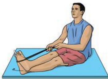
Resisted ankle inversion