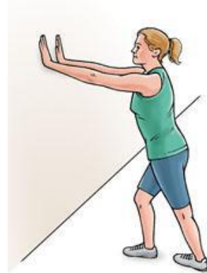
Standing calf stretch