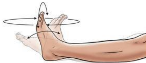
Ankle active range of motion