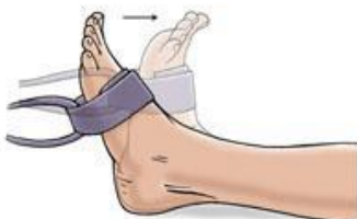
Resisted ankle dorsiflexion