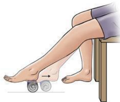
Frozen can roll