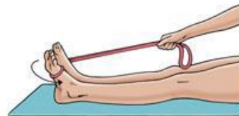
Resisted ankle eversion