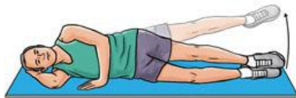
Side-lying leg lift