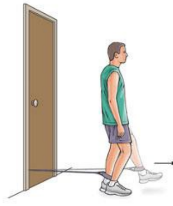
Knee stabilization: C