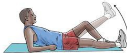
Straight leg raise