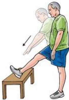
Standing hamstring stretch