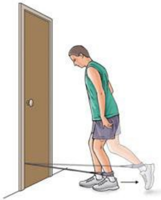
Knee stabilization: A