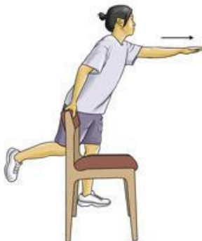
Balance and reach exercise A