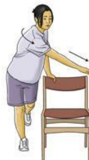
Balance and reach exercise B