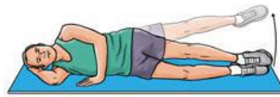
Side-lying leg lift