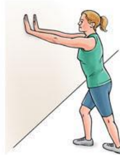
Standing calf stretch