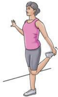
Anterior compartment stretch