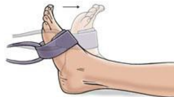
Resisted ankle dorsiflexion