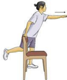
Balance and reach exercise A