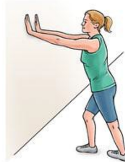
Standing calf stretch