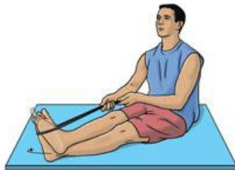
Resisted ankle inversion