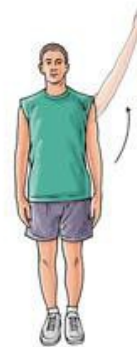
Single-arm shoulder abduction