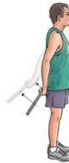
Wand exercise: Extension