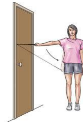
Resisted shoulder adduction