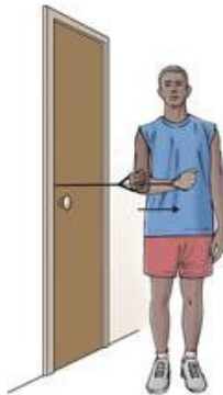
Resisted shoulder internal rotation