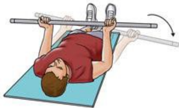
Wand exercise: External rotation