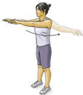
Horizontal shoulder abduction