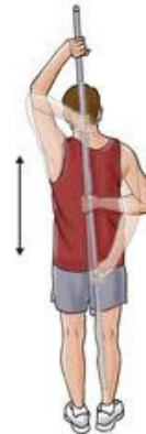
Wand exercise: Internal rotation