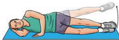
Side-lying leg lift