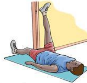
Hamstring stretch on wall