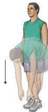
Iliotibial band stretch (standing)