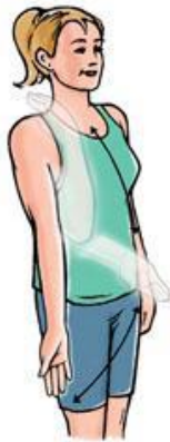
Active elbow flexion and extension