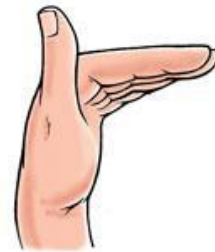
Straight finger flexion