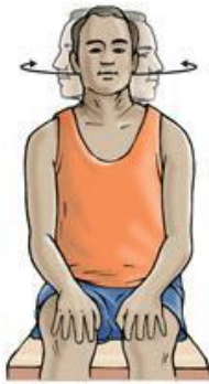
Active neck rotation