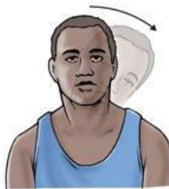
Active neck sidebend